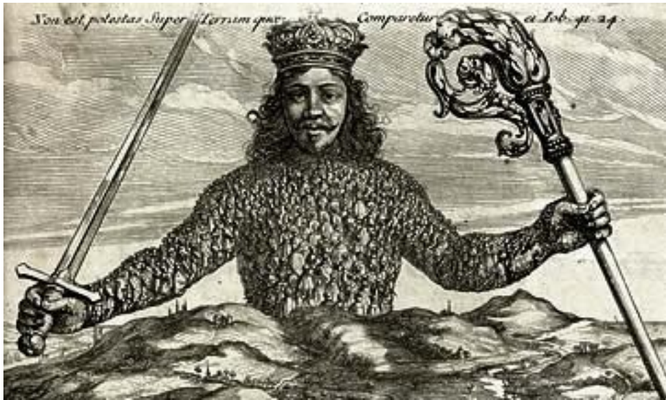
A detail from the engraved title page of Hobbes's Leviathan (1651)